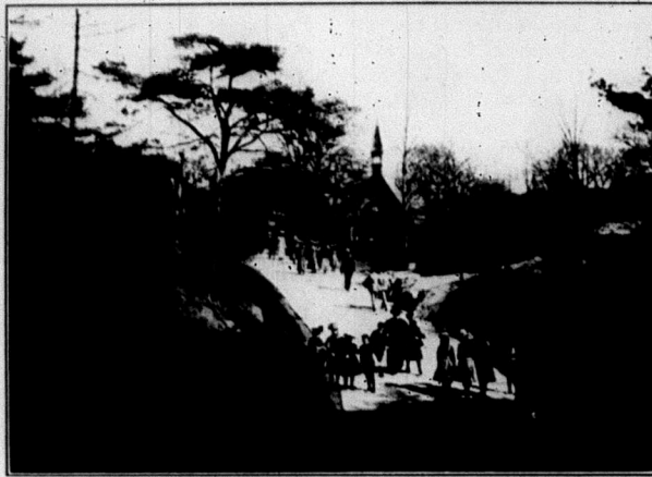
"THE LITTLE CHURCH IN THE WILDWOOD"

I. Central in such a program should be a yearly picnic and field day with dinner on the grounds, games for the young people, and a lecture by some visitor or some phase or phases of community life. Such a gathering would be a good way of inaugurating a program of social service; and thereafter would be the culmination of the activities of the year—an occasion for receiving of reports and review of the work, and the launching of new efforts in the light of experience.